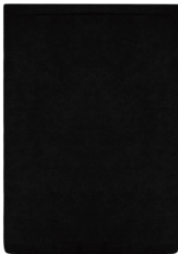
BEAMSPLITTER GLASS PROTECTIVE SLEEVE